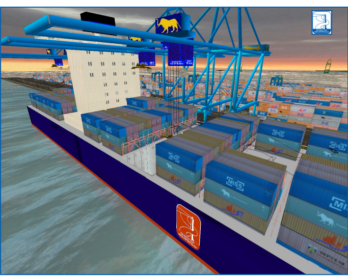
The New Solution for Port Operator Training, Procedure Definition and Equipment Design